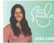
8x10 Specialty Portrait $14