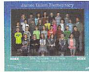
Class Photo $12