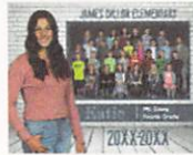
8x10 Class Group Portrait Combo $20